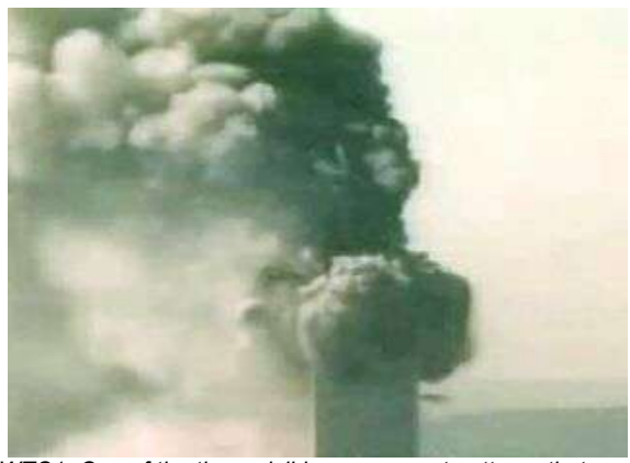
WTC1: One of the three visible consequent patterns that were visible during the early stages of the collapse of the tower.