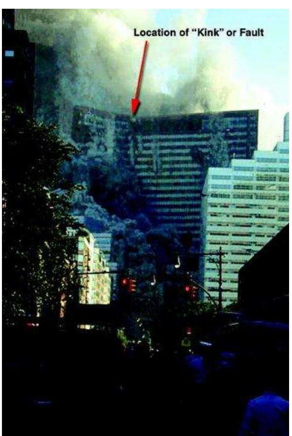
WTC7 collapsing – the structure is descending to the ground maintaining its shape, completely symetrically, which give us a proof of a deliberate demolition