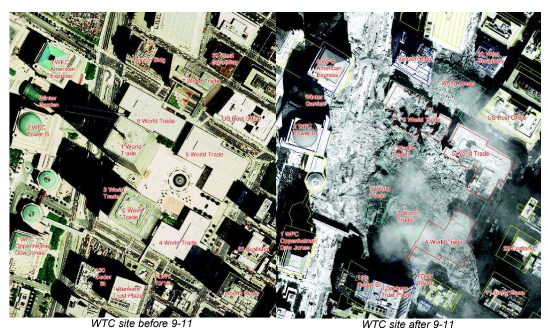
Figure 1: Satellite images of the WTC site before and after the attacks (9/17/2001)

Still on 9/11/2001, Osama Bin Laden (who is supposed to be responsible for WTC bombing in 1993 and for bombings of the US Embassies in Kenya and Tanzania in 1998) and his terrorist network Al Qaeda became a prime suspect. Later, 19 Muslim men, mostly of Saudi origin, were identified as the hijackers. The cause of those three complete collapses that occurred that day (WTC1, WTC2, WTC7) was explained in detail by The WTC Report as a result of the structure's extreme heat stressing with the influence of airplane's impact damage and the usage of the double lightweight trusses (for WTC1 and WTC2) and as a result of some unfortunate coincidences in combination of severe office fire. [1],[2]