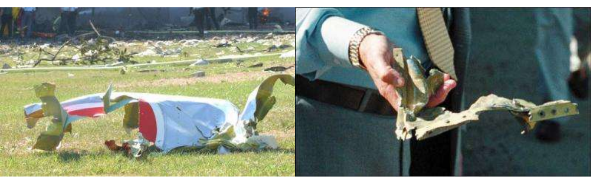
Figure 3: All that was left of a "Boeing 757" for public. One would expect more...