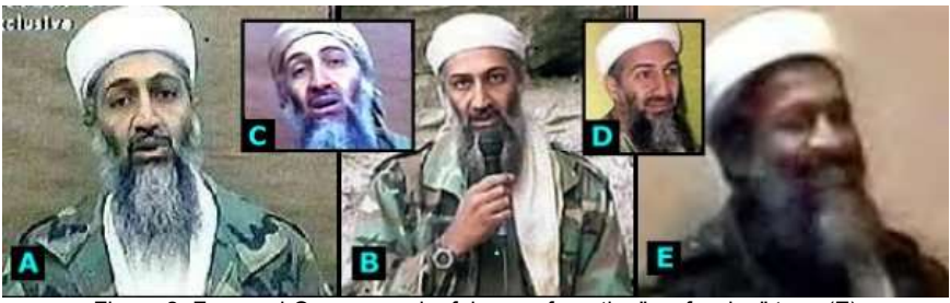
Figure 2: Four real Osamas and a fake one from the "confession" tape (E)

The main piece of evidence against Al Qaeda that has been available to the public is the famous Osama Bin Laden "confession" video showing Osama discussing and planning the attacks. As you can see in the Figure 2, it's quite obvious, that the recording is a fake. In addition to this, his own family did not recognize him and the barely understandable speech was also mistranslated — which included a never existing Osama's statement, that Al Qaeda had nukes. It is obvious, that the tape is a fake, and quite a bad one — which also brings up a question, why those terrorist with millions of dollars and a world wide network always tape the most crucial video evidence in the as much as possible worst quality? But maybe that's just the classic terrorist way how to do it. [13],[14],[15]